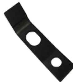
GTO Delivery Gripper