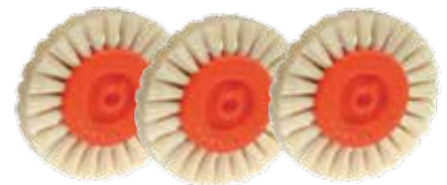
Brush Wheel (Paper)