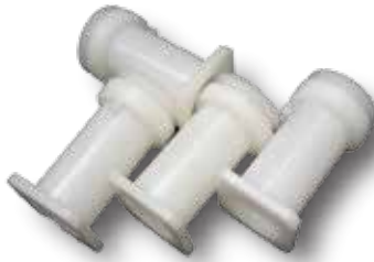
Feeder Sucker Nozzel