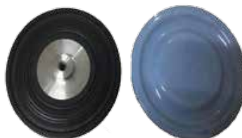
Coating Pump Diaphragm