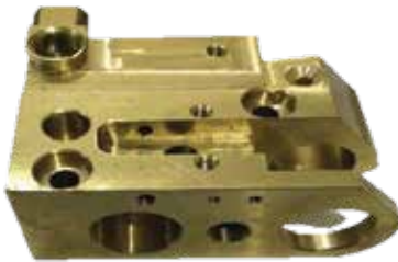
CD-SM 102 Side-lay Housing