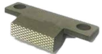
T-Shape Gripper Pad