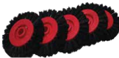
Brush Wheel (Board)