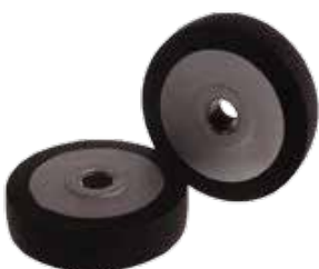
Forwarding Roller Drop Wheel