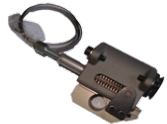
Forwarding Sucker CPL