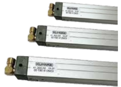
Auto Plate Clump Tube