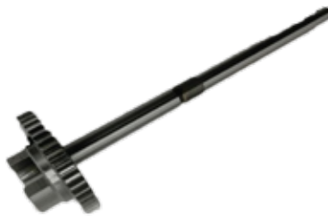
Alcohol Gear Drive Shaft