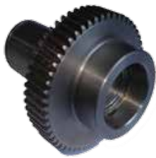
Dampening Roller Guide Block