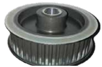
Toothed Lock Washer SM-CD-XL Machines