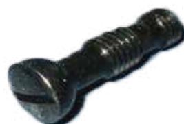
Plate Clamp Screw