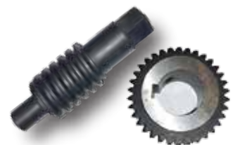
SM102 Worm Gear Set