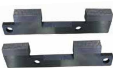
Gripper Pad Left-Right