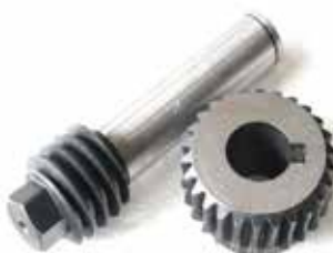
SM 74 Worm Gear Set