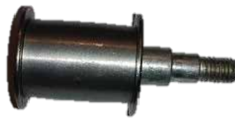
Feeder Guide Roller - Pulley