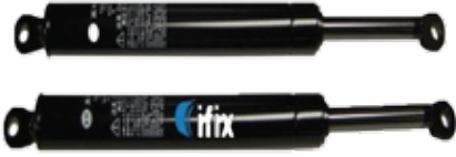
SM102 Top Guard Gas Strut