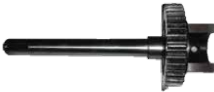
Water Roller Gear Shaft