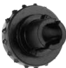
Star Wheel GTO-SM52