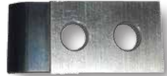
Perfecting Gripper Urethane