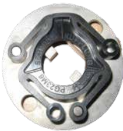
Side-lay Drive Disk