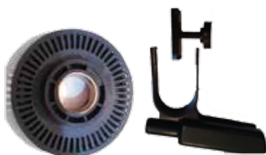
Suction Drum Holder & Disc CPL