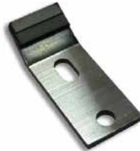
Ranger Drum/Swing Gripper