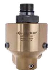
Rotary Valve For Chilled Rollers