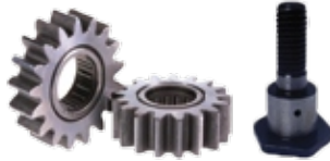
Intermediate Gear & Pin Small