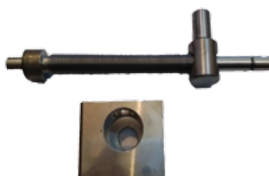
Threaded Spindle Set