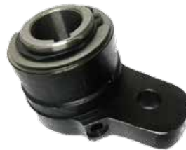
Over Running Clutch