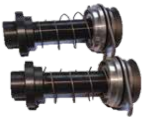
Forwarding Sucker Plunger With Holder