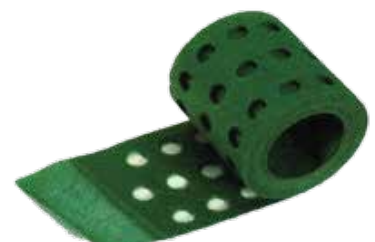
Feeder Belt - SM74