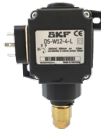
Oil Pressure Switch