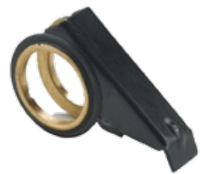
Chain Delivery Gripper