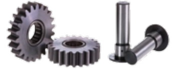
Intermediate Gear & Pin Large