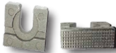
Impression/Transfer Cylinder Gripper Pad