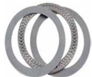
Thrust Bearing For CD-SM Machine