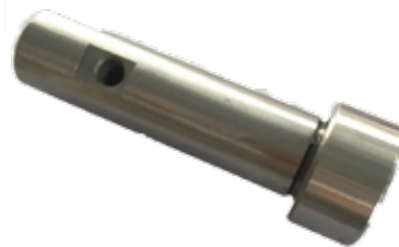
Cam Follower Perfecting Unit