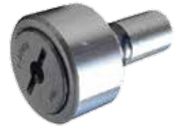
GTO Cam Follower