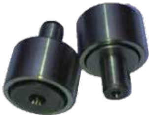
Cam Follower For Side-lay