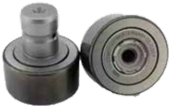
Impression/Transfer Cylinder Cam Follower