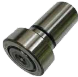
Perfecting Unit Cam Follower